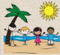
Heading to the beach